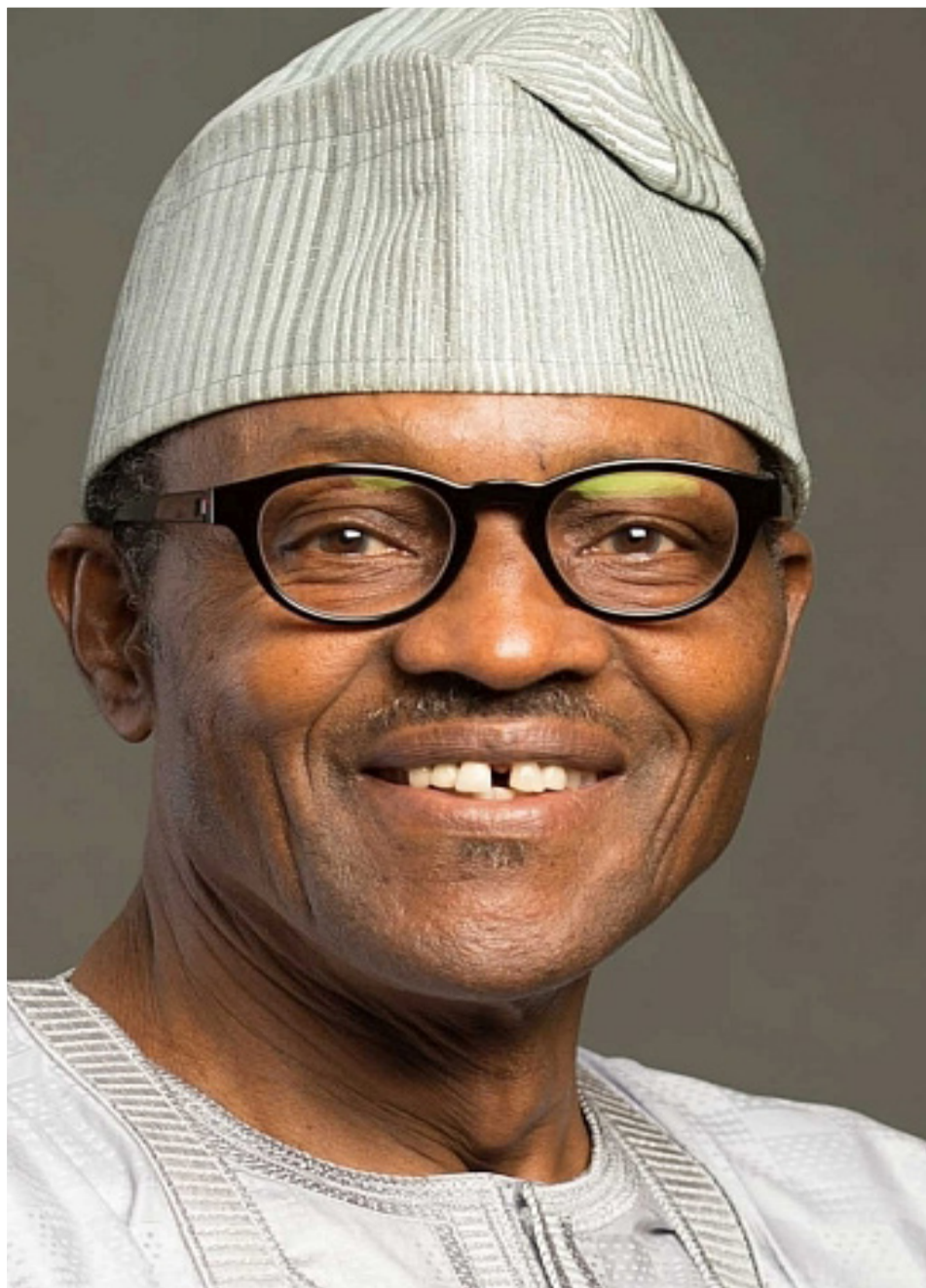
MUHAMMADU BUHARI PRESIDENT, COMMANDER-IN-CHIEF OF THE ARMED FORCES FEDERAL REPUBLIC OF NIGERIA