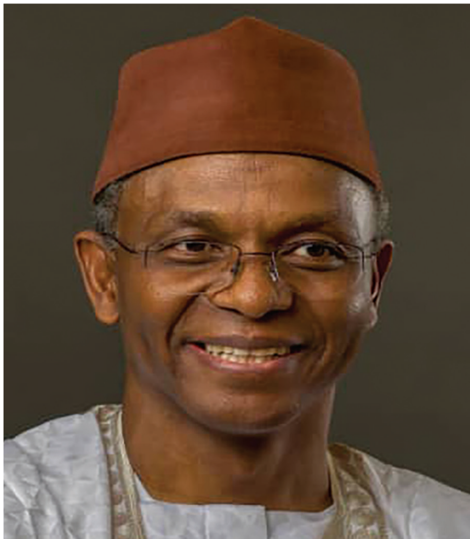
MALLAM NASIR EL-RUFAI EXECUTIVE GOVERNOR OF KADUNA STATE

The results of the last local government elections, is a pointer to the fact that Southern Kaduna is now All Progressives Congress (APC).